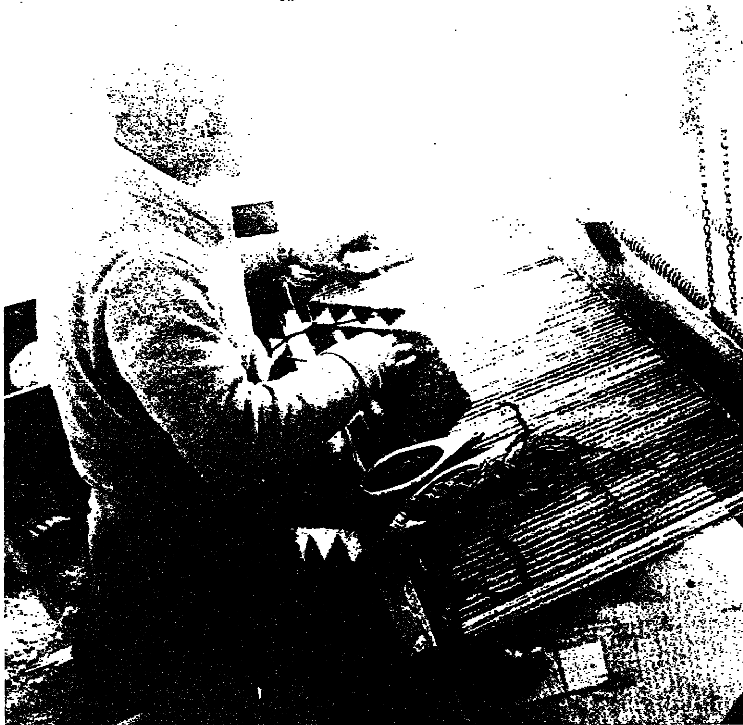
A Madaba weaver makes one of the town's famous woollen rugs from yarn dyed with natural vegetable colours on his hand-made wooden loom. Some of the outstanding products